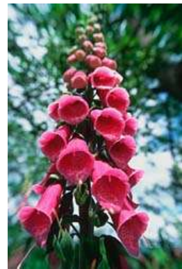
Biennial: Digitalis Purpurea

Biennials are plants that require two years to complete their life cycle. First season growth results in a small rosette of leaves near the soil surface. During the second season, stem elongation, flowering and seed formation occur, followed by the entire plants death, leaving the seeds to carry on the next generation.