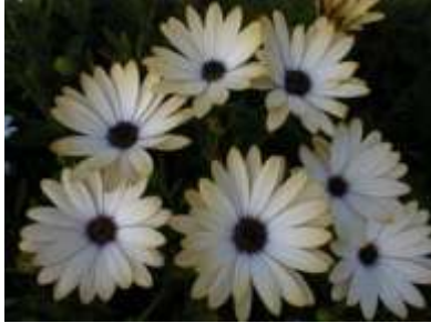
Annual: Osteospermum 'Buttermilk'

An annual is a plant that performs its entire life cycle – from seed to flower – within a single growing season. As the flowers wilt, those that were pollinated begin to form seeds. Once the seeds are dispersed, the annual plant dies, its genetic material now invested in the seeds. Most seeds go through a period of dormancy and sprout the following spring if conditions are right. Others may survive for years until they have adequate moisture, light and soil to germinate. Annuals usually bloom all summer and require watering and fertilizing for their short but intense life cycle.